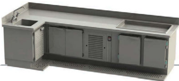
A sample of a 3D design for a stainless steel cold counter (below)

Precetti Srl and Precetti Inc will be attending Seatrade in Miami Cruise Shipping Miami at the Miami Beach Convention Center from March 16-19, 2015 at booth 1563. ●