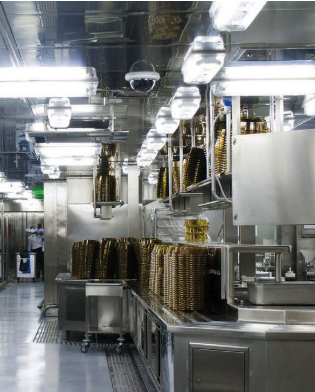
A Precetti-designed galley on board a Costa ship (main); Precetti's show cooking trolley, designed for cruise ships (left inset)

areas. It manufactures wall panels and doors for provision stores, modular cabins and B15 walls and ceilings. Furniture and installations always comply with the latest USPHS requirements.